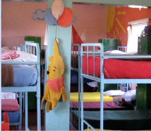
Limuru Children's Centre

Our support to Limuru Children's centre and the Limuru feeding program for the elderly ensures that more than 400 women are saved from starvation and hundreds of orphaned and vulnerable children get new opportunities to live their dream.