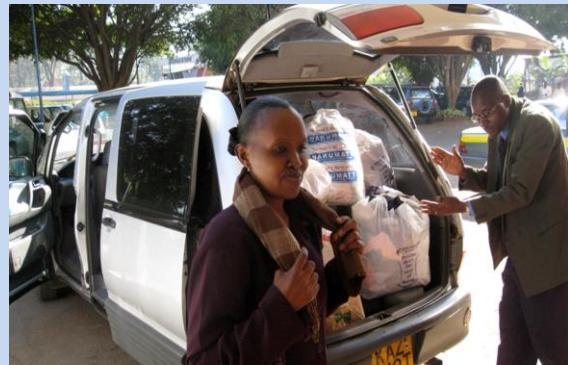
LGT staffs donate food and clothes to LCC & the elderly feeding program

LGT is a founding partner of Limuru Children's Centre and Limuru feeding program both located in Limuru. Founded more than 10 years ago, these programs are transforming lives of the vulnerable members of society. The MD of LGT engaged with these projects to initiate organisational culture for giving back. He was driven by the principle of ' every good deed counts, and every time is a good opportunity to give '